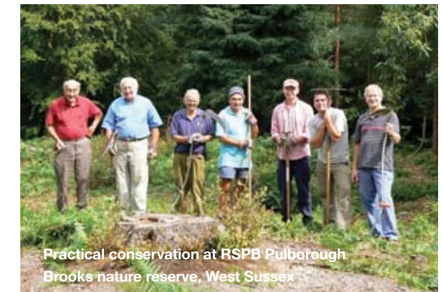
Practical conservation at RSPB Pulborough Brooks nature reserve, West Sussex

On occasion the Fund may support projects which are not close to a CEMEX quarry or landfill, this is rare and is usually on the basis that the project will benefit a large number of visitors, is of national significance to the environment, and/or has high visitor numbers likely to include those from areas where CEMEX operates.