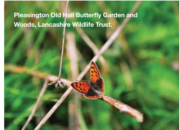
Pleasington Old Hall Butterfly Garden and Woods, Lancashire Wildlife Trust.