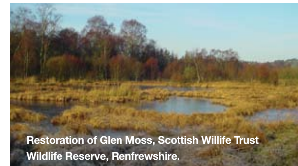
Restoration of Glen Moss, Scottish Willife Trust Wildlife Reserve, Renfrewshire.