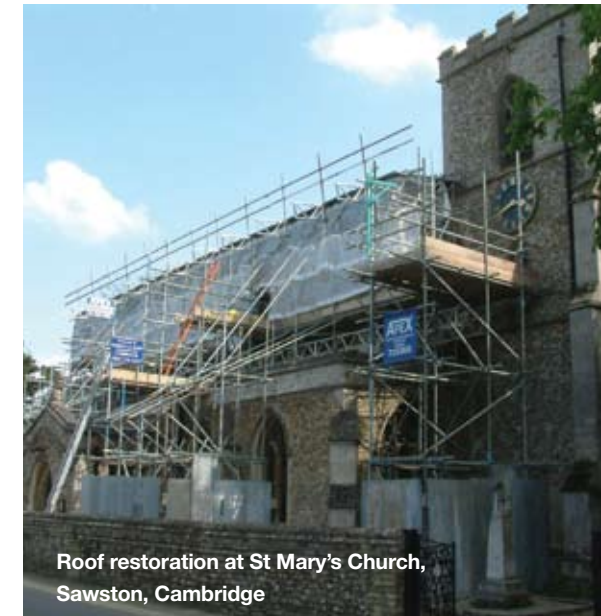
Roof restoration at St Mary's Church, Sawston, Cambridge